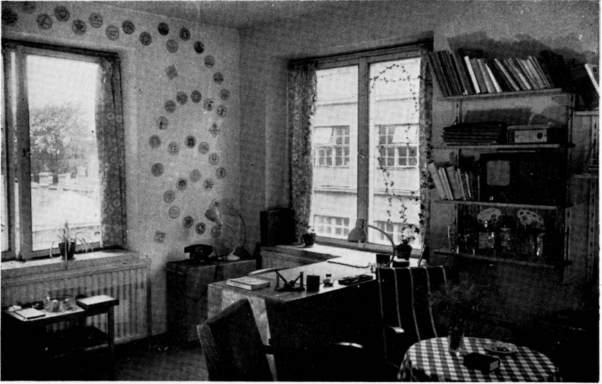
INTERIOR OF A STUDENT'S ROOM