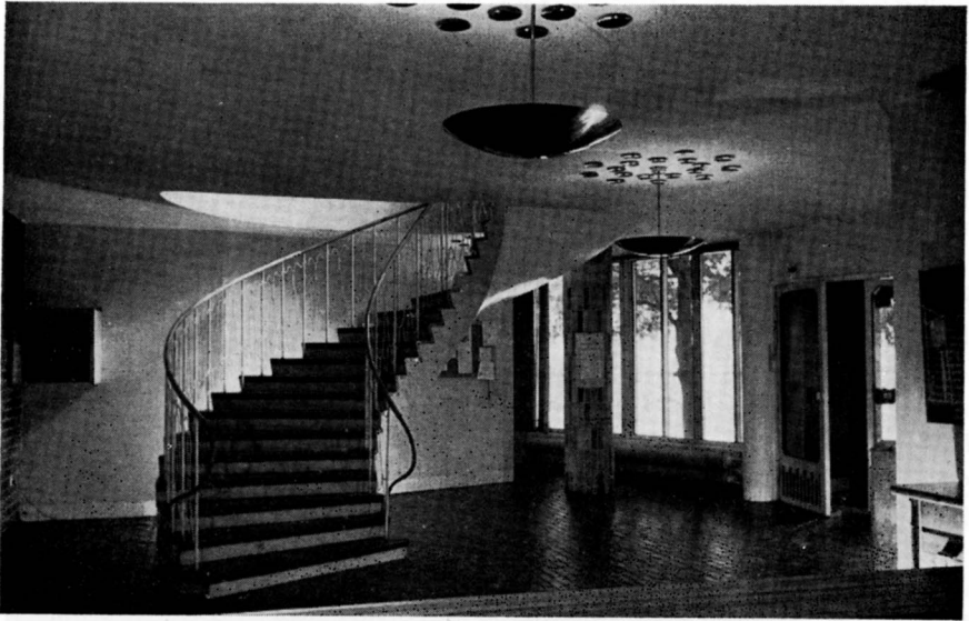
THE FOYER IN THE STUDENTS' HOME