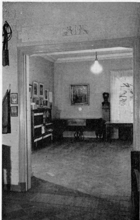
THE "SIBELIUS ROOM" AT THE INSTITUTE OF MUSIC

persons. It may safely be said that no library in northern Europe has received so many valuable gifts of books as the library of Abo Academy. With a strong emphasis on books on science, the library's main purpose is to aid in research and instruction while at the same time retaining its importance as a Swedish-Finnish national library.