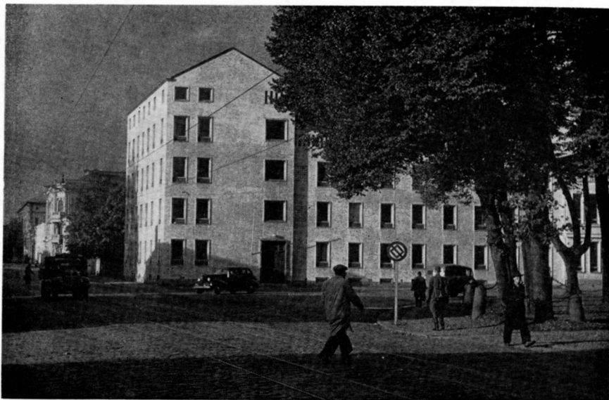
THE NEW SCHOOL OF CHEMICAL ENGINEERING

has grown rapidly and now comprises five schools or departments, in addition to various scientific institutes. The Department of Humanities is the largest, its main object being to graduate teachers for the Swedish high schools and colleges in Finland. Many courses in various fields are offered by this Department, with special emphasis on history, literature, and languages. Future teachers may also study in the School of Mathematical Science, in which mathematics, physics, chemistry, and geology are the main subjects. The Department of Political Science provides instruction in disciplines of especial use to people who intend to enter the government and the civil service; the Department of Physical Chemistry trains engineers for careers in industry, and the School of Theology offers instruction for future ministers and teachers of theology and religious history. There is also a School of Com-