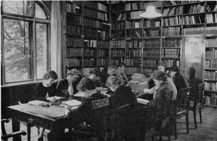
A SEMINAR IN THE DEPARTMENT OF HUMANITIES