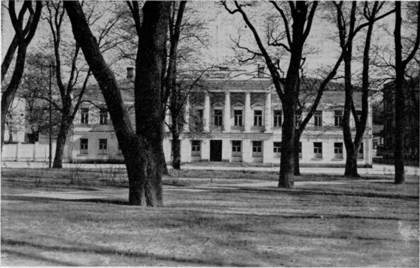
THE MAIN BUILDING OF ÅBO ACADEMY