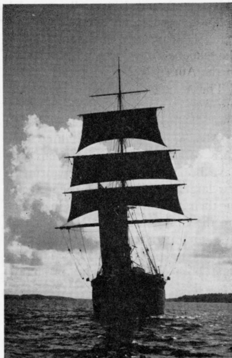
THE SCHOONER "SIGYN"

Among the Academy's departments, the largest and perhaps the most important is the library. The library now contains about 400,000 volumes, most of which have been donated by private